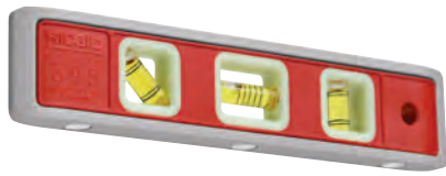
No. 395 Torpedo Level